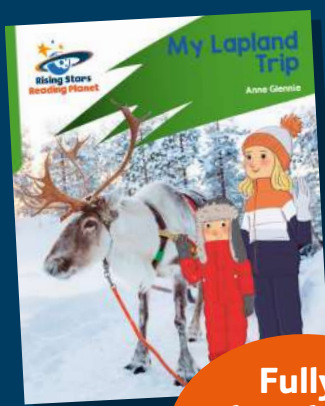
Fully-decodable reading books

Within the programme, there are lots of beautifully created and engaging resources such as flashcards, sound mats, and online, interactive Big Books and quizzes to develop learning further. There is also a fully matched series of decodable reading books from a variety of genres, which will be used in class as well as sent home for home reading. These books can also be accessed on the online platform to read as eBooks. If your school has a subscription to Rocket Phonics Online, they can allocate the eBooks for home reading.